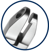
Hole Punch T00571