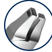
Horizontal Indent T00573