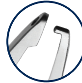
Retention Dimple T00575