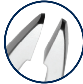
Eraser Plier T00576 To remove enhancements