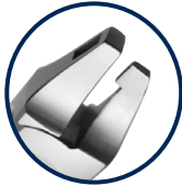
Vertical Indent T00574