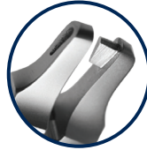
Tear Drop Hole T00572