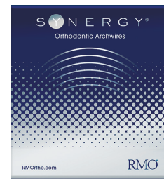
GHOST™ Aesthetic XPress™ SE & TRU-CHROME®