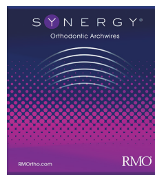
BENDALOY® Beta Titanium