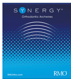
XPress™ SE SuperElastic NiTi