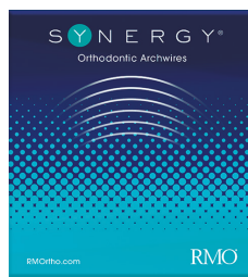
TRU-CHROME® Stainless Steel