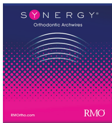
TRANSFORM™ HA Heat-Activated NiTi

These work great with our line of Synergy Class of Archwires.